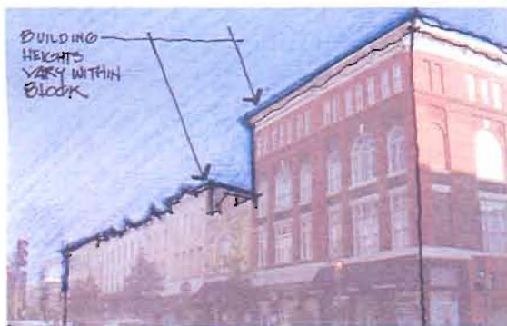
A variety of building heights within a single block provides visual interest and variety.