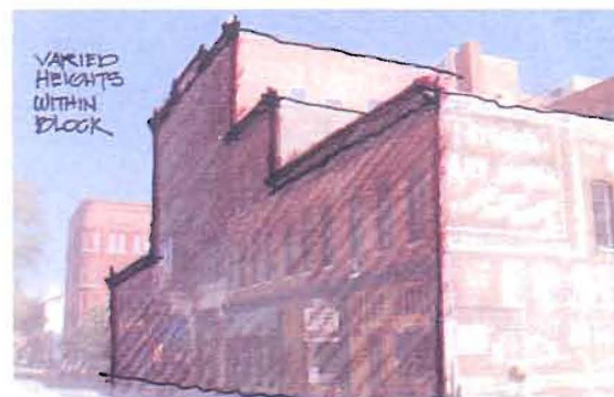
Varied heights create a unique streetscape and movement in the skyline.