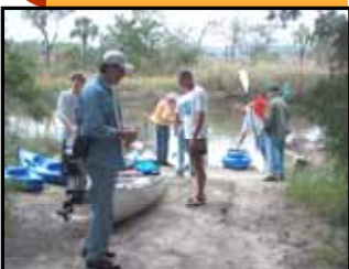
Rivers Alive 2006

For more information call 651-1456 or 651-1454.