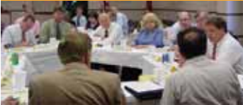
Luncheon on August 22, 2007

On Wednesday, August 22, 2007 the Chatham Urban Transportation Study, the Metropolitan Planning Organization (CUTS/MPO) for the Savannah area, held a luncheon to allow the leadership from Chatham County and surrounding counties to discuss regional transportation opportunities. Staff from the Georgia Department of Transportation (GDOT) and a representative from the State Transportation Board also attended.