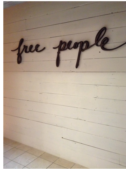
06. BUILT EXAMPLE OF THE SAME SIGN (IN A DIFFERENT FINISH)