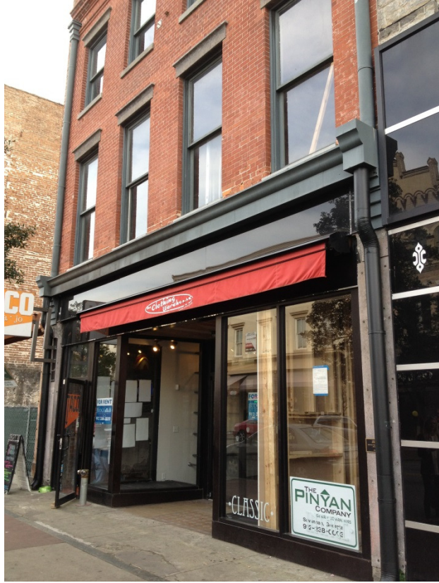
02. EXISTING CONDITION (RED AWNING HAS BEEN REMOVED)