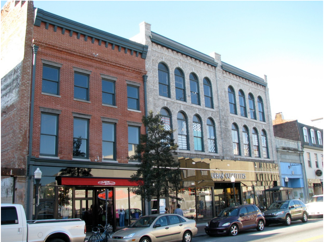
05. CURRENT CONTEXT PICTURE