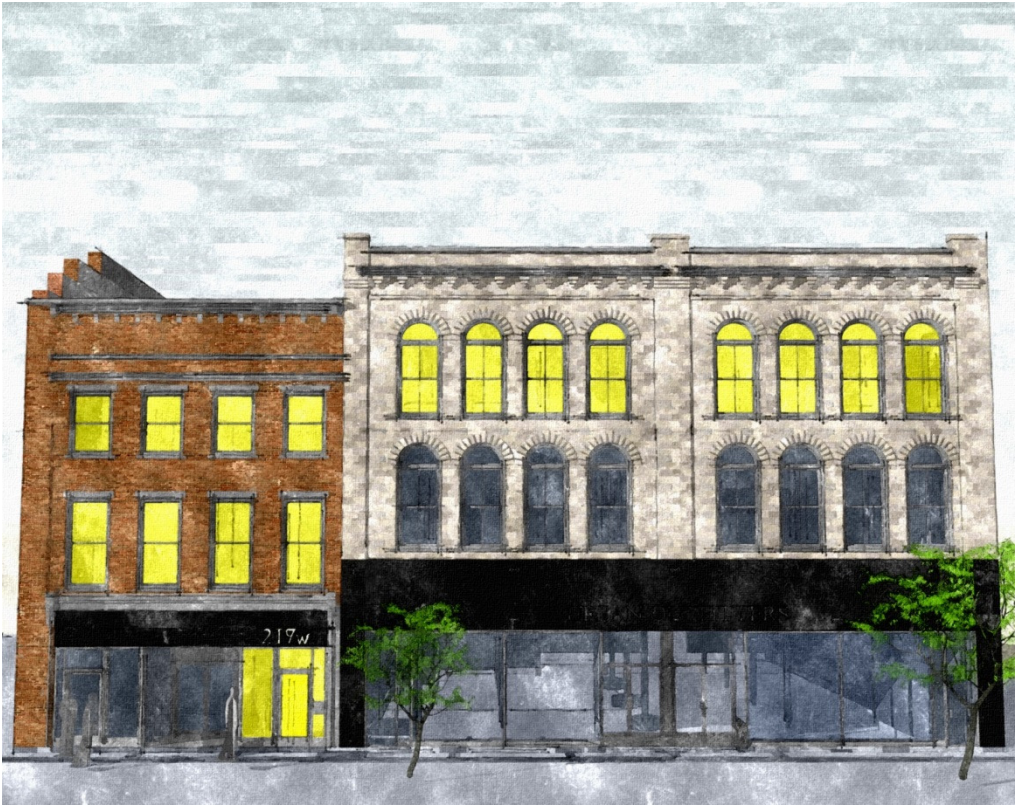
04. CONTEXT ELEVATION