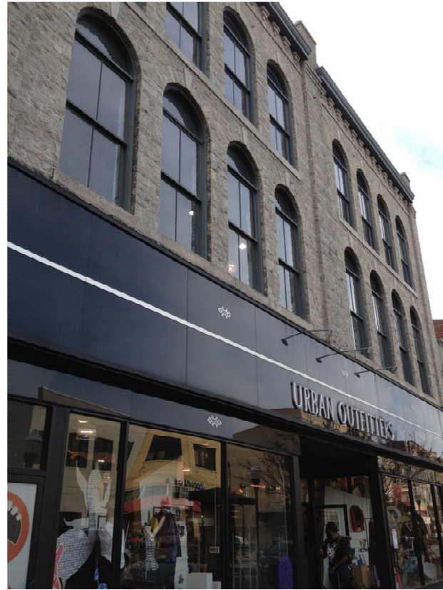
03. ADJACENT TENTANT SIGNAGE