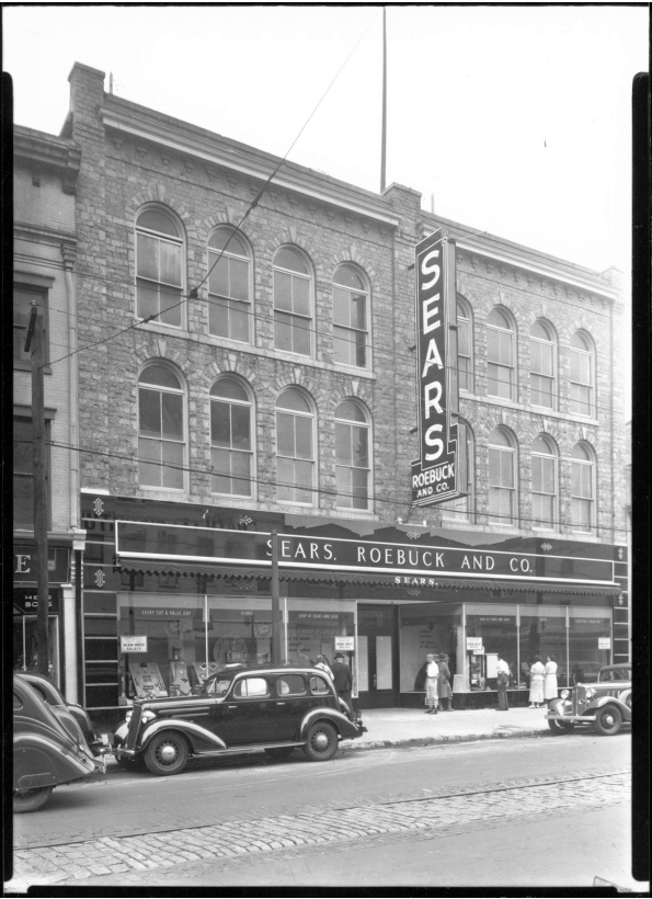
02. HISTORIC PHOTO 2