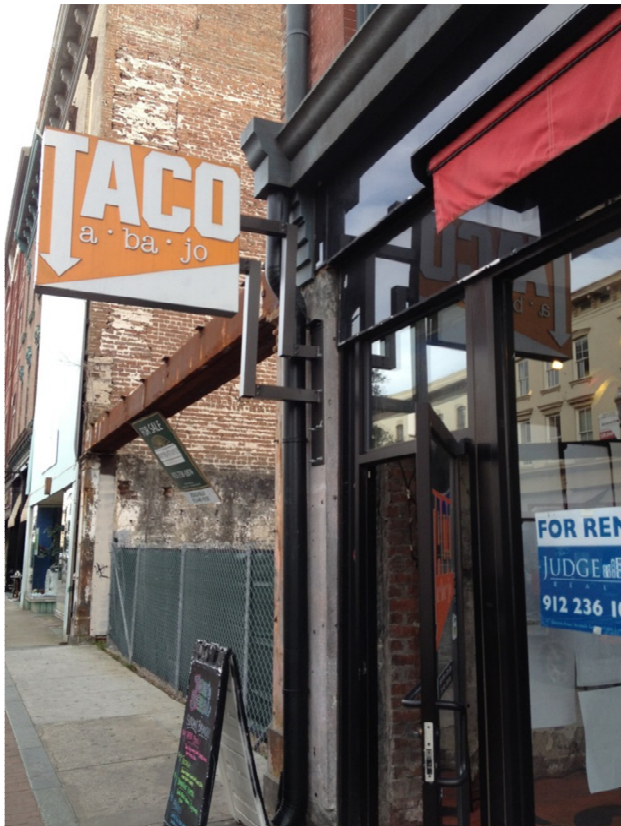
01. ADJACENT SIGN CONTEXT