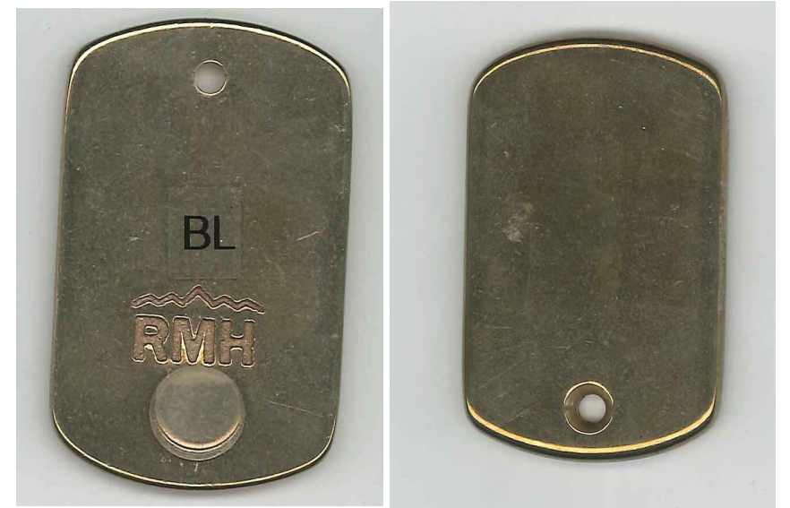
07. SIGNAGE BRASS MATERIAL A BASED ON ROCKY MOUNTIAN HARDWARE FINISH.

FREE PEOPLE – 217 W. BROUGHTON STREET – SAVANNAH,GA