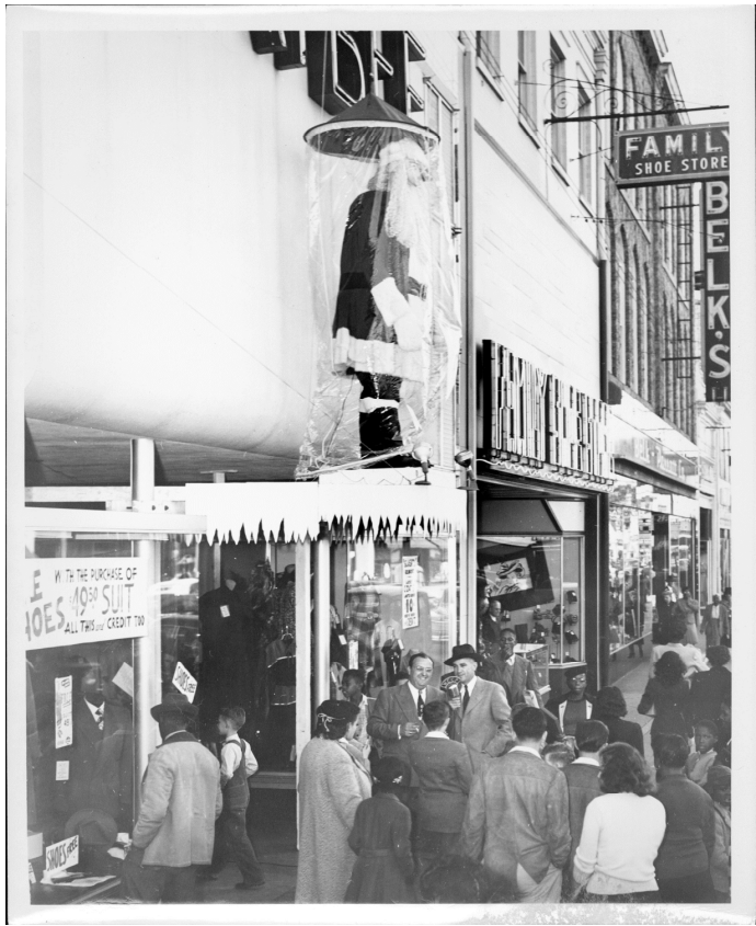
01. HISTORIC PHOTO 1