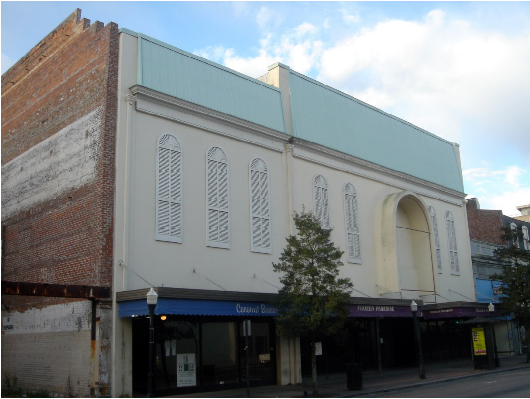
03. HISTORIC PHOTO 3