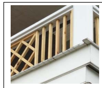
Replacement: New Wood Pickets