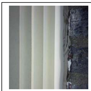
Routine Maintenance: Caulking and Painting