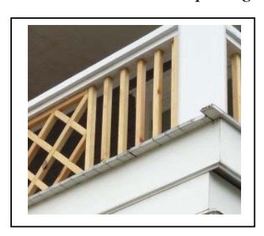
Replacement: New Wood Pickets