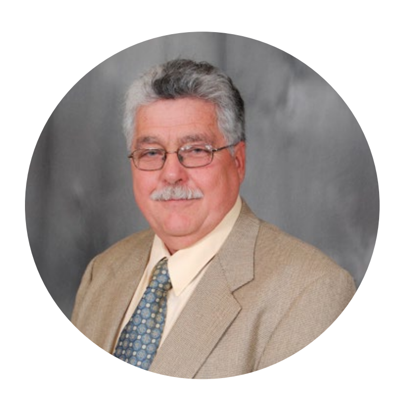
Don Bethune, Mayor of Garden City