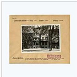
Pictured in 1929

It later became the home of American Revolutionary War brigadier general Lachlan McIntosh . [1]