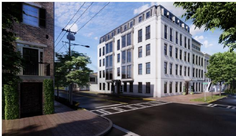
Figure 3 – 302 East Oglethorpe Avenue (rendering – under construction)

Staff would recommend further study of the proposed height to see how the visual compatibility could be strengthened, by looking at how the sixth floor could be more integrated with the lower five floors, which could allow for as perceived reduction in the overall scale.