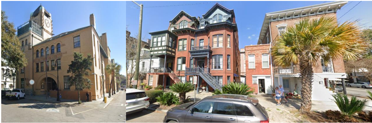
Figure 6 – 124 Bull Street & 122-132 East Oglethorpe Avenue

b. Contributing resources on the same parcel shall not be subdivided or recombined unless the proposed results in the same parcel configuration that existed when one of the contributing resources was constructed.