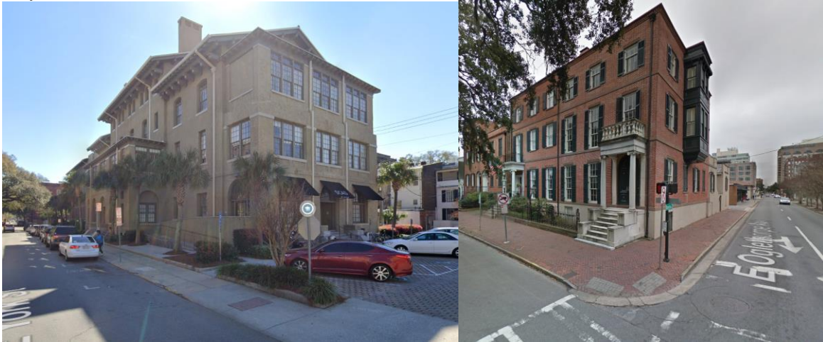
Figure 5 – 115 East York Street & 101-109 East Oglethorpe Avenue