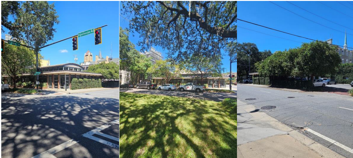
Staff Site Visit Photos – Views of front (East Oglethorpe Avenue), and side / rear (Drayton Street & East York Lane) elevations

The surrounding context includes free-standing frame and masonry (stucco) contributing buildings to the west along this block of East Oglethorpe Avenue, the free-standing masonry (brick) contributing collection of buildings of the Board of Education that takes up the entire block directly to the south across the landscaped median, and a combination of attached and partially free-standing frame and masonry (brick and stucco) contributing and non-contributing buildings to the east on East Oglethorpe Avenue.