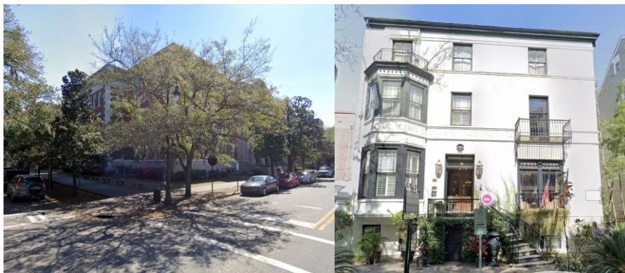
Figure 4 – 208 East Bull Street & 14 East Oglethorpe Avenue

The standard is met. The Oglethorpe Avenue corridor contains a variety of building types that are of varying sizes, ranging from institutional buildings to religious, to residential and commercial. This varied collection of types of building results in a notable variation in lot sizes within the visually related context. Lot sizes range from larger ones that are 300', 120' and 60', and smaller ones that are 38', 31' and 15' among others. The proposed recombination would be in keeping with the varied historic context of the Oglethorpe Avenue corridor and surrounding area.