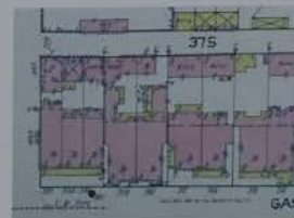
1916 Sanborn Map

Of Interest: Street address numbering has changed. Stable on Lane now used as Upholstrg & cabinet Repairing.