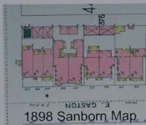
1898 Sanborn Map

Of Interest: X's on Carriage Houses indicates use as stables. Note only two units shown, all other evidence supports three units were built.