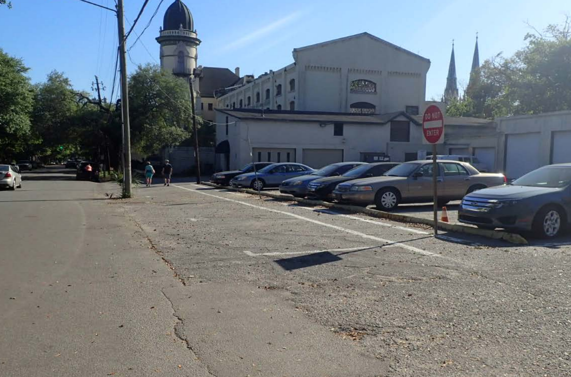
Habersham at Ogelthorpe