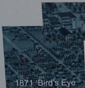
1871 Bird's Eye

Barnard Architects and Commonwealth Construction look forward to this opportunity to again improve and preserve the historic fabric of Savannah's National Landmark Historic District.