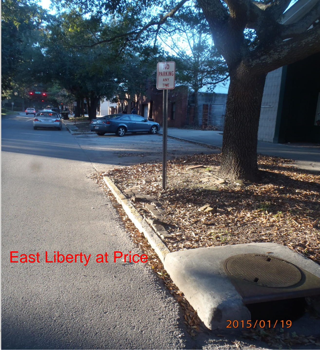
East Liberty at Price