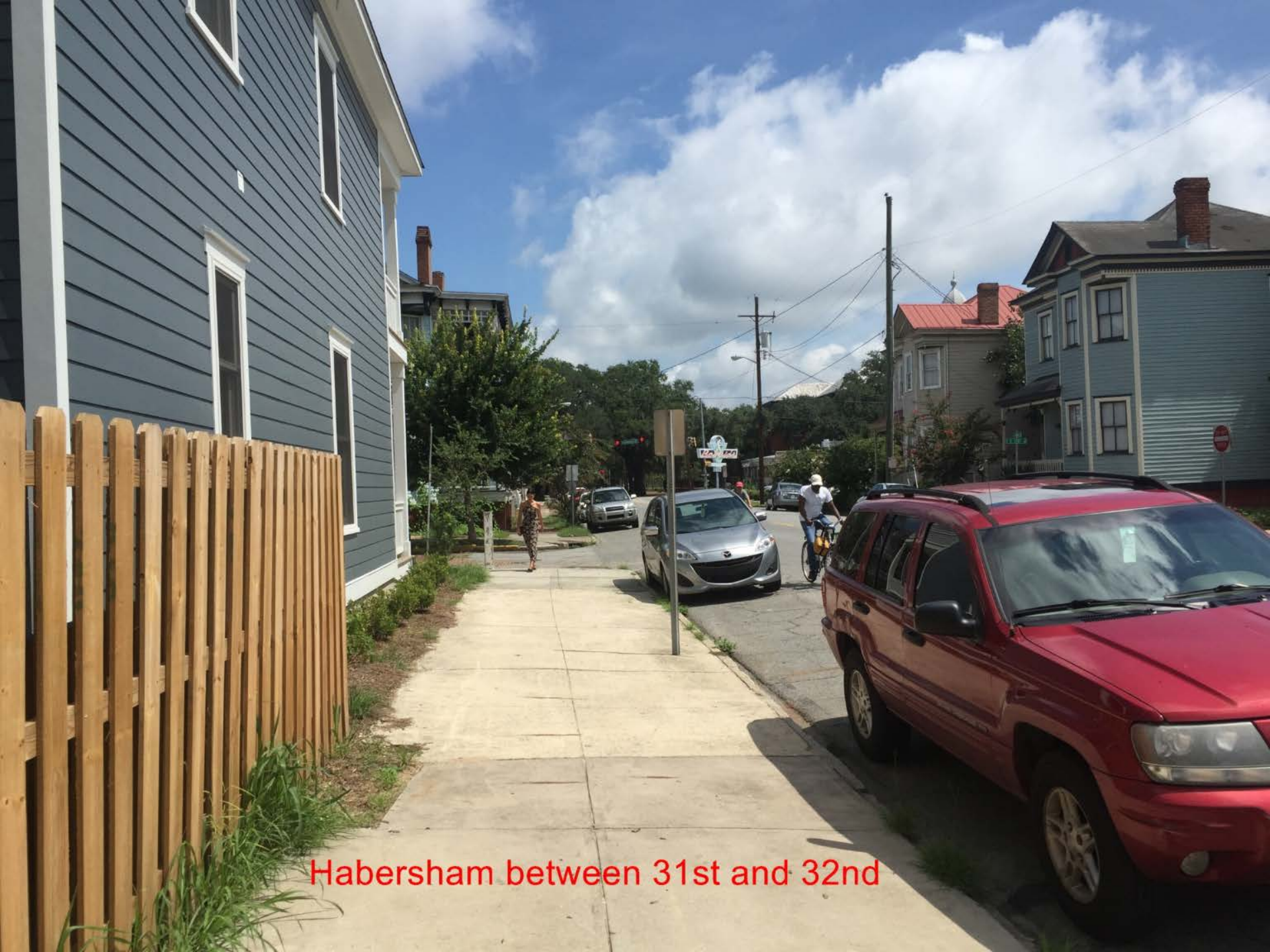
Habersham between 31st and 32nd