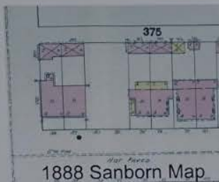
1888 Sanborn Map

Of Interest: Earliest visual depiction in the 1871 'Bird's Eye' view of Savannah