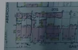
1955 Sanborn Map

Of Interest: Piazza (or porch) was added on Gaston –1900 across all three units for a reported $100.