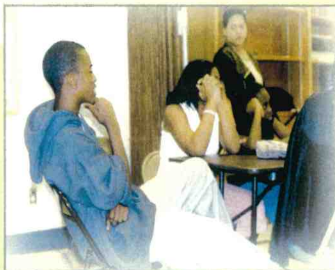
"Make sure it happens!"