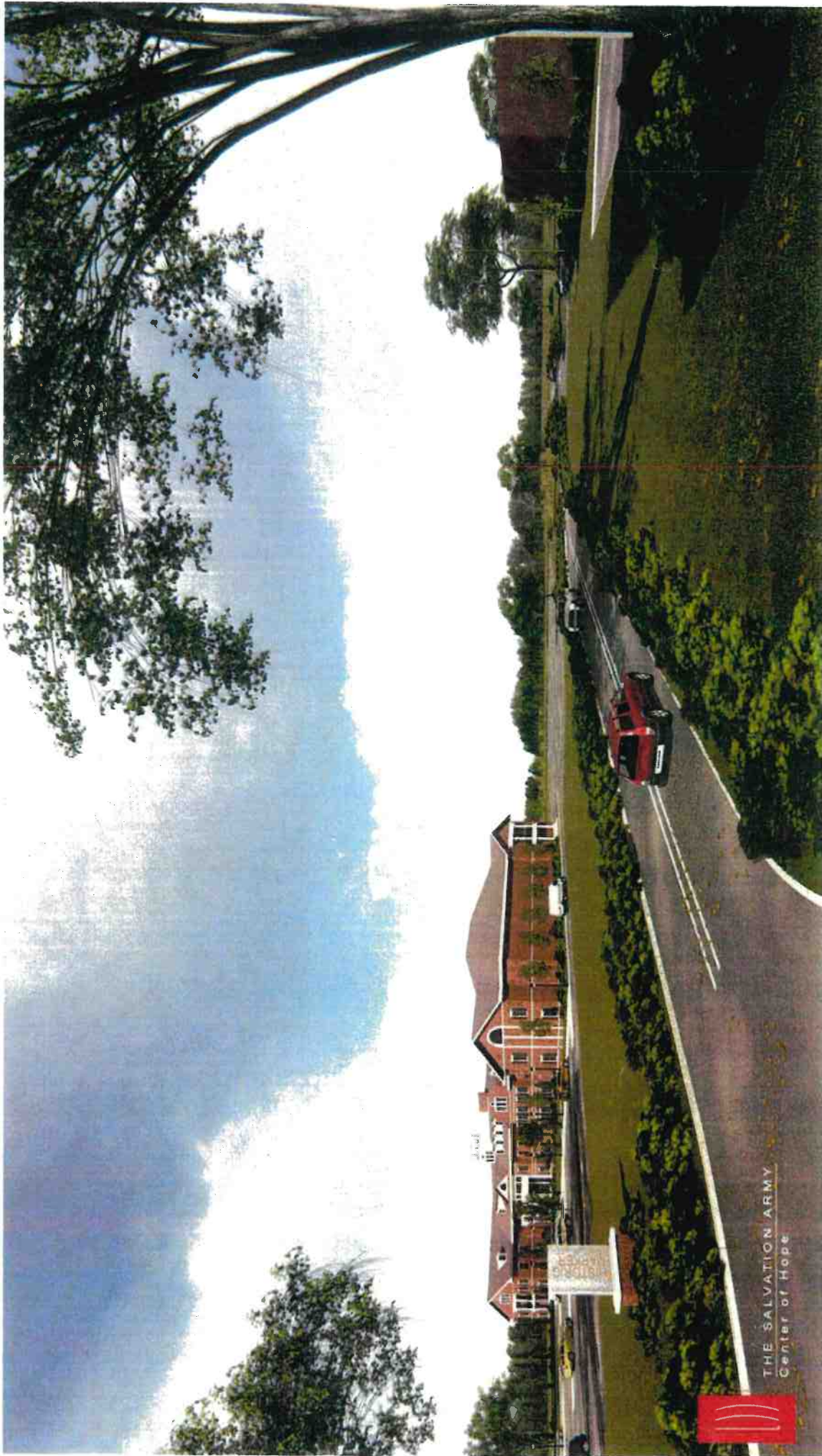
Petition – Page 8 Exhibit “180-190 bed Shelter” B.) View